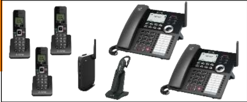
Up to 6 terminals