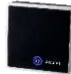
Alcatel IP DECT Repeater