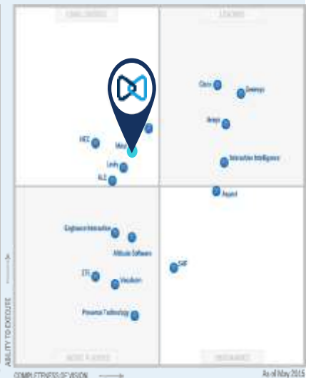
Magic Quadrant for Corporate Telephony